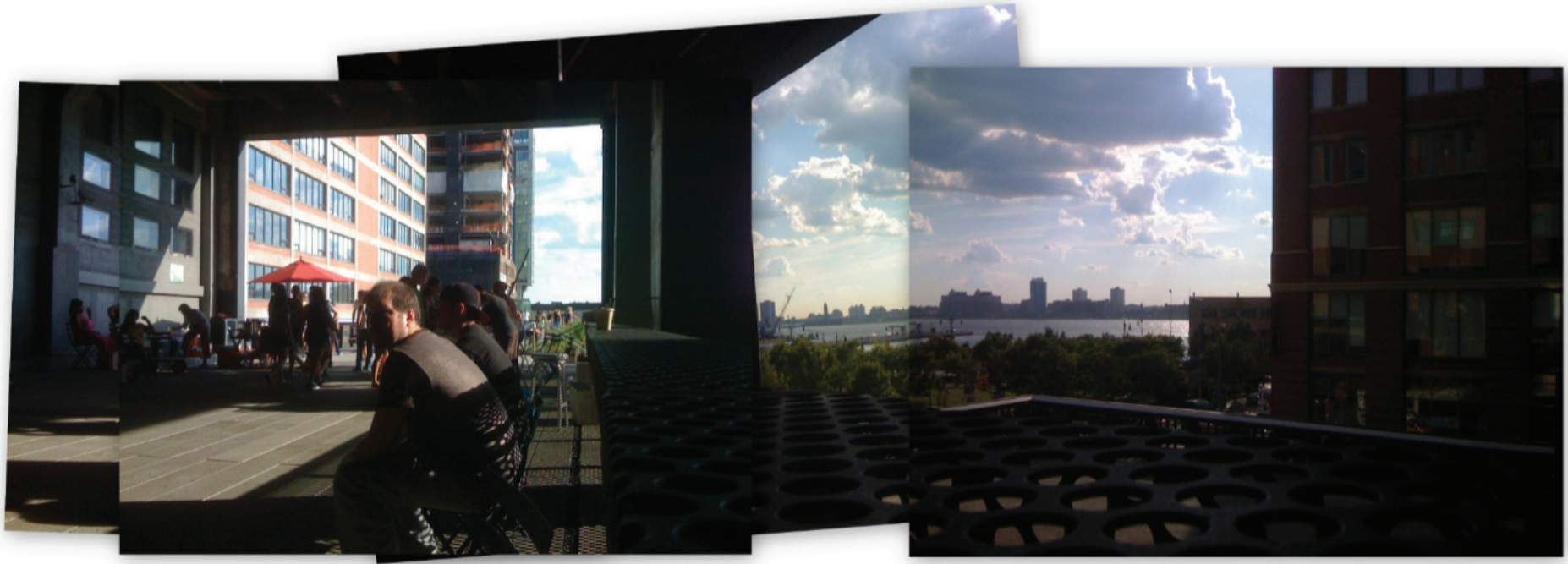
[ the High Line ]