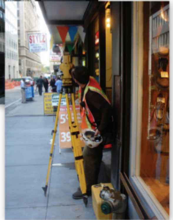
[ a surveying guy was suryed by me, Fulton Street, NY ]