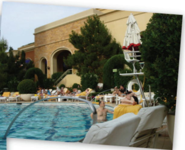
[ Wynn, Vegas ]