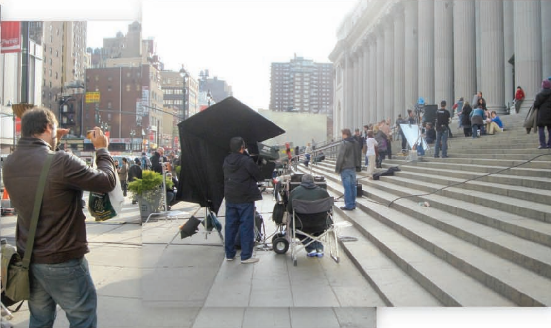
[ lots of camera and shooting works here, me, him, him and him.