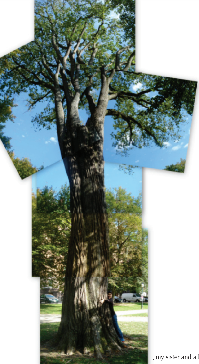
[ my sister and a big Tree at Princeton, NJ ]