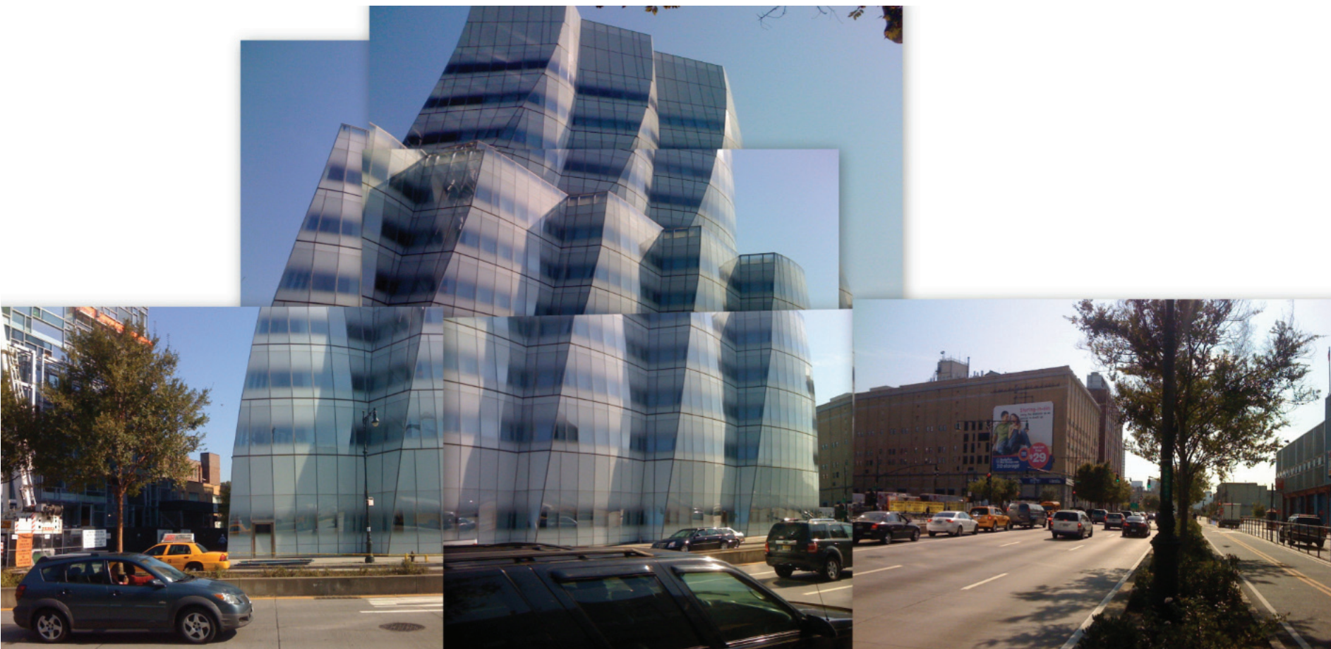
[ Westside Highway, NYC ]