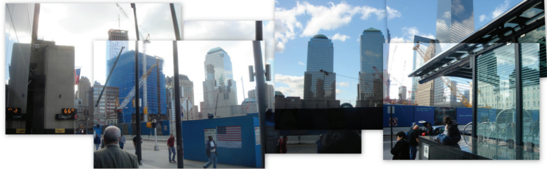
[ a panoramic of WTC site, Summer 2009 ]