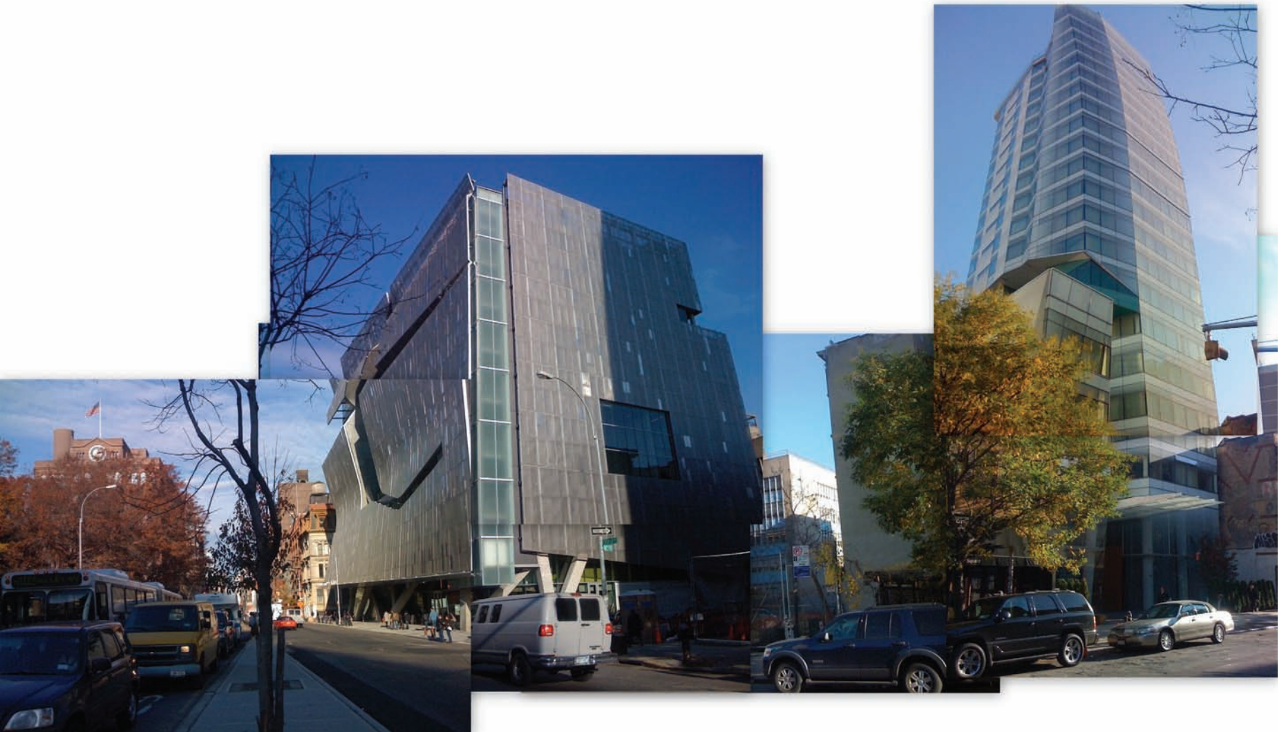
[the cooper union and east village]