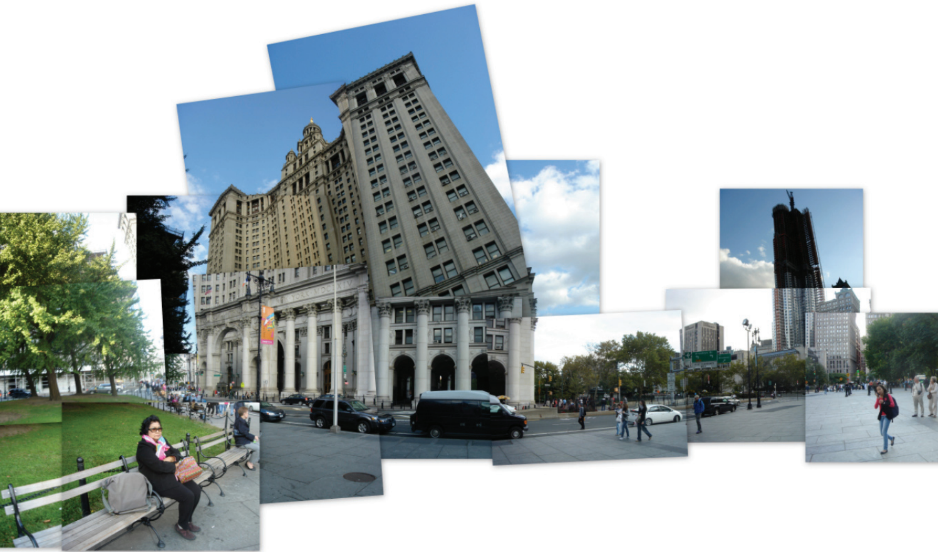
[ my mom (visiting NYC Fall 2009) in front of Municipal/City Hall ]