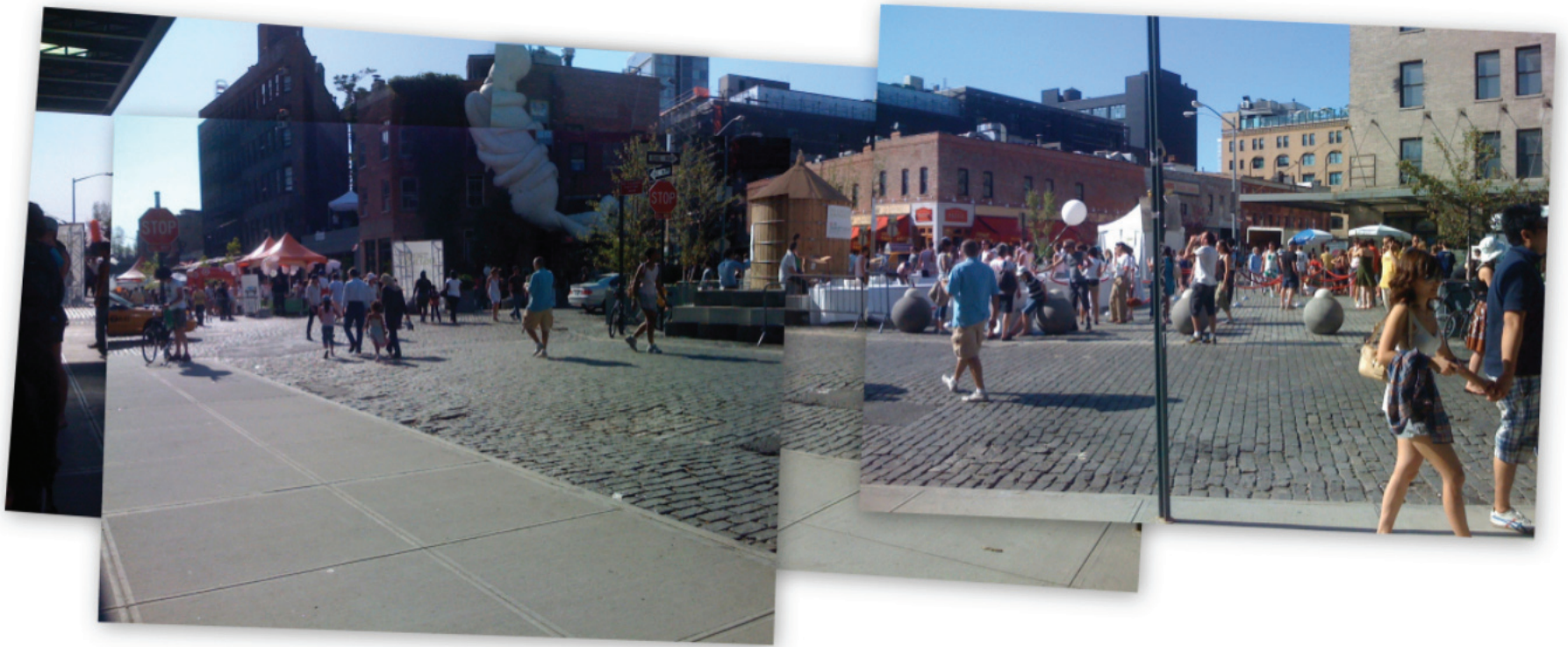
[ Meat Packing District, NYC ]