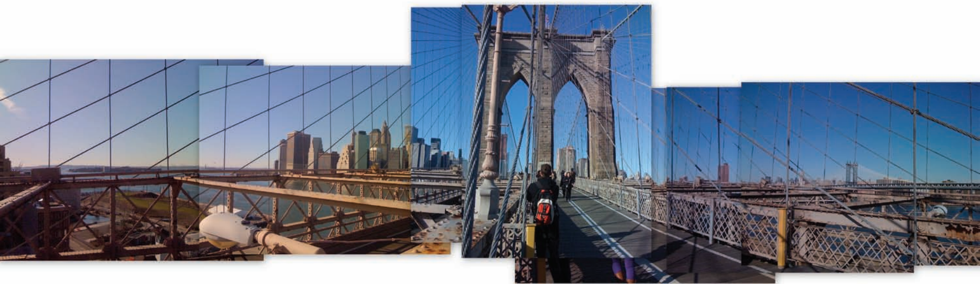
[ Good weather day in December's winter, Brooklyn Bridge, NY ]