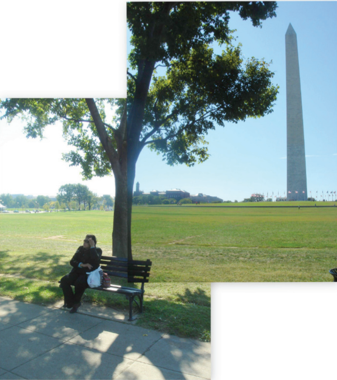
[my Mom again, Washington, DC ]