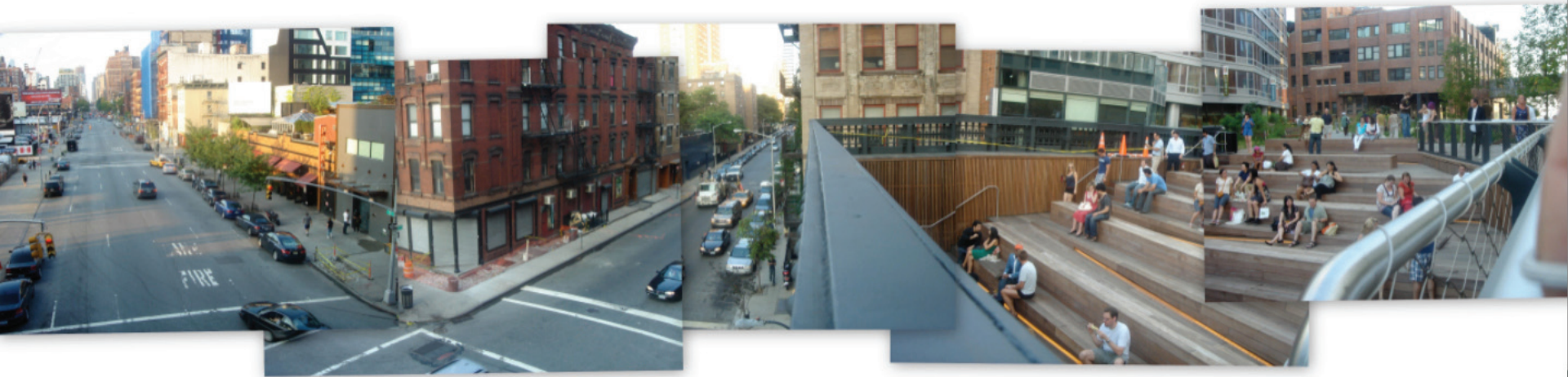
[ the High Line ]