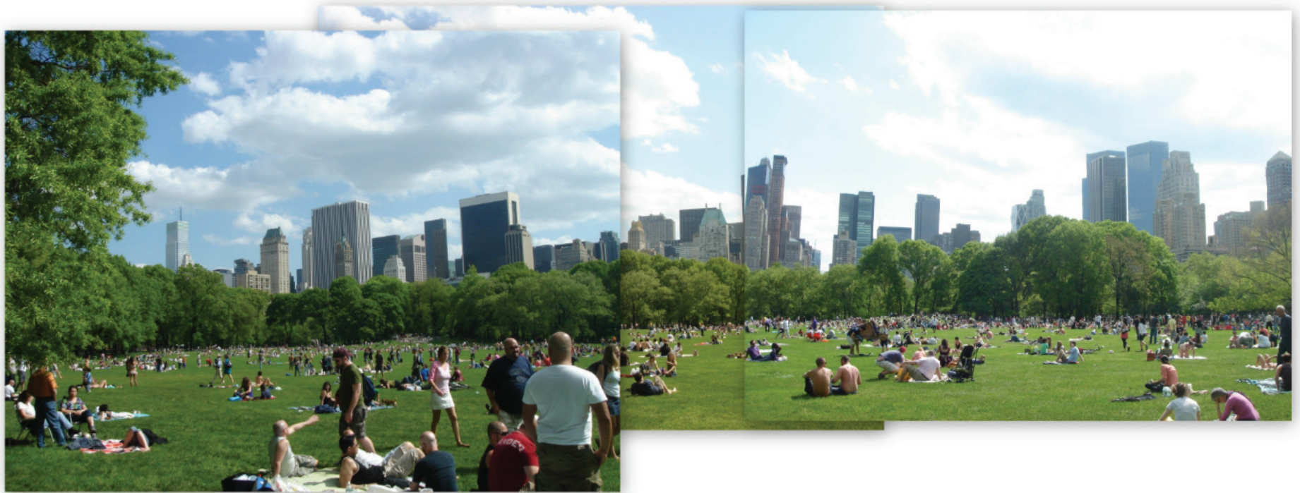
[ Central Park, NYC ]